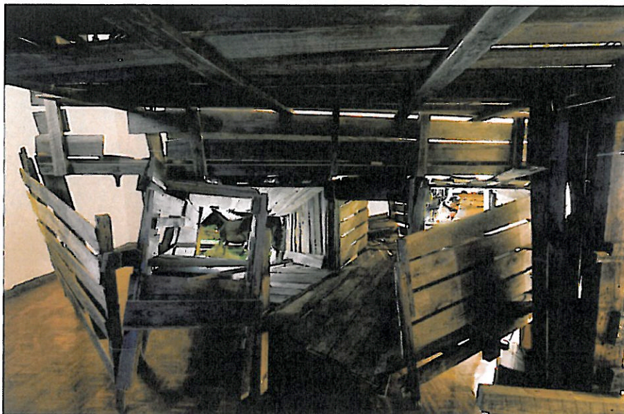
Mika Rottenberg, Cheese , 2007-8, mixed media, installation view.